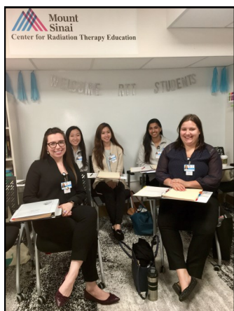
Mount Sinai Radiation Therapy Students Class of 2019

Mount Sinai’s Department of Radiation Oncology and Stony Brook University’s School of Health Technology and Management have entered into an agreement to provide collaborative radiation therapy education across both campuses. The Mount Sinai Center for Radiation Therapy Education offers students a bachelor’s degree in health science through Stony Brook, followed by a year of clinical specialization in radiation therapy through our radiation oncology departments across the Mount Sinai Health System.